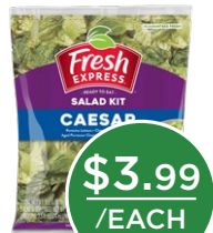
9-11 OZ. Fresh Express Salad Kits