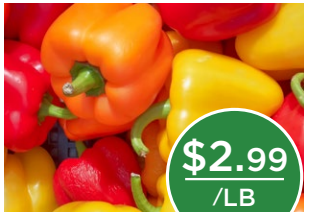
RED, ORANGE OR YELLOW Colored Peppers