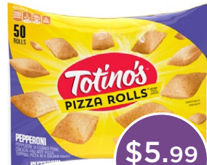
50 CT. | ASST. VARS. Totino's Pizza Rolls