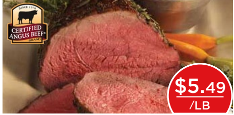
Sirloin Tip Roast