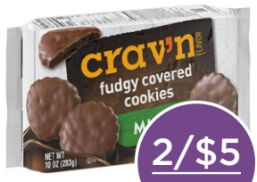
10-12.5 OZ. | FUDGE MINT OR FUDGE STRIPE | ASST. VARS. Cravin' Cookies