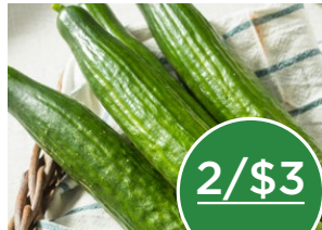
Crisp English Cucumbers