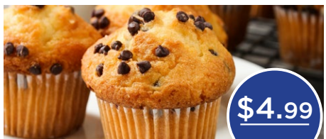
4 PACK | ASST. VARS. Muffins