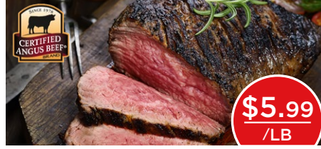
Top Round Roast or London Broil