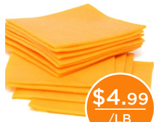
YELLOW OR WHITE American Cheese