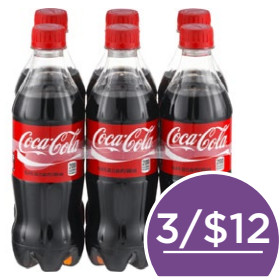
16.9 OZ. | REG. OR DIET | ASST. VARS. Coca Cola 6 Pack