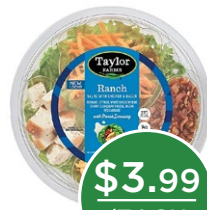
Taylor Farms Salad Bowls