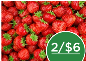
1 LB. | SWEET Strawberries