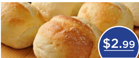
8 PK. Semi Hard Buns