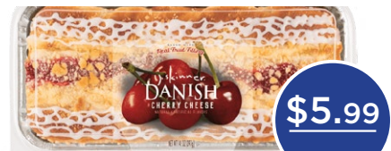
14 OZ. | APPLE, BLUEBERRY, OR CHERRY | ASST. VARS. J Skinner Danish