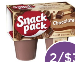
4 PK. | ASST. VARS. Hunts Snack Pack Pudding