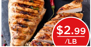
FRESH GRADE A | VALUE PACK Boneless Skinless Chicken Breast