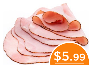
Sugardale Virginia Ham