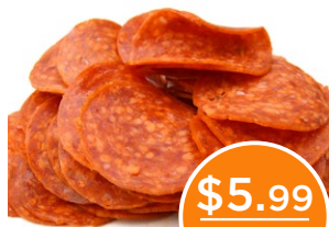
Margherita Sliced Salami or Pepperoni