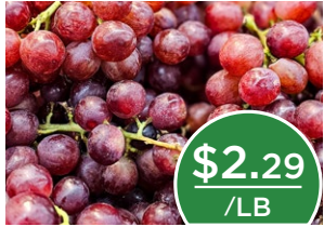
Red Seedless Grapes