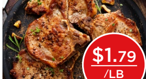
VALUE PACK Bone-In Assorted Pork Chops