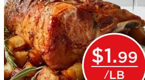
Bone-In Center Cut Pork Loin or Rib Roast