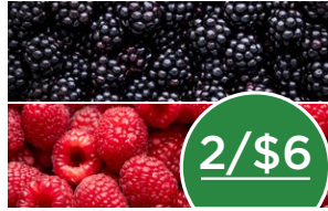
6 OZ. | SWEET Blackberries or Raspberries