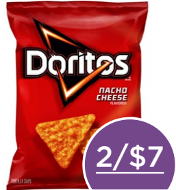
9.25 OZ. | ASST. VARS. Doritos Tortilla Chips