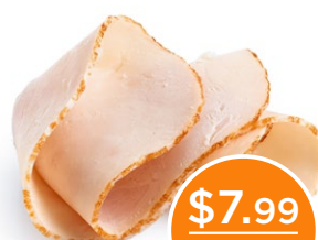
Butterball Oven Roasted Turkey