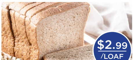
English Toasting Bread