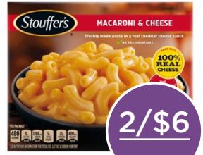
8.37-12 OZ. | STUFFED PEPPERS OR MAC & CHEESE | ASST. VARS. Stouffer's Entrees